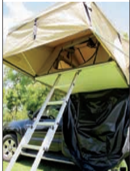
With the tent raised the retractable aluminum ladder sits under cover from the elements, allowing you to pull off wet gear before climbing in to the tent. A ladder extension kit is available for lifted vehicles.