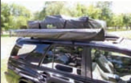
The Ironman 4x4 Luxury Rooftop Tent from Camel 4x4 & Outdoor mounts directly to most vehicle roof bars and racks. When collapsed the tent is protected from the elements by a rugged, 1000D waterproof PVC cover.

Whether you're camping for one night or living in your 4x4 on a multi-week trail adventure, the Ironman 4x4 Luxury Rooftop Tent from Camel 4x4 & Outdoors has you covered. 4WD