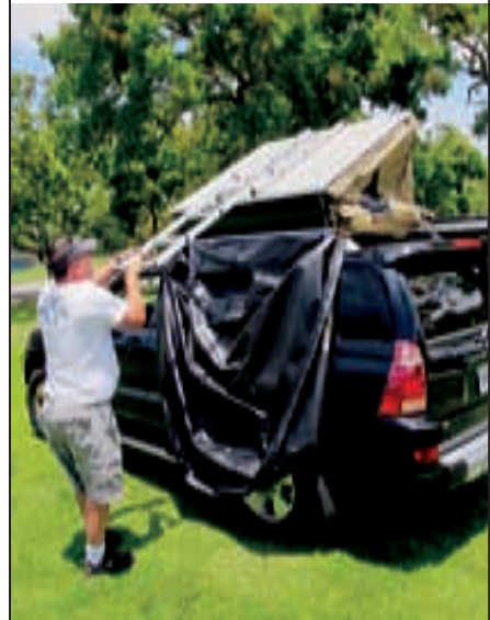
The retractable aluminum ladder is used as a leverage point in folding out and raising the tent.