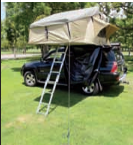
Easy to set up, the Ironman 4x4 Luxury Rooftop Tent and Annex comes complete with all necessary installation hardware and instructions.